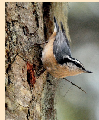
Red-breasted Nuthatch Sitta canadensis

This smallest chickadee is a regular resident of older forests, while the common black-capped chickadee prefers more open areas.