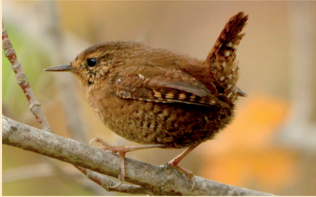
Pacific Wren Troglodytes pacificus

The “clicking” sparrow with white outer tail feathers and a dark hood forages for seeds around shrubs and trees.