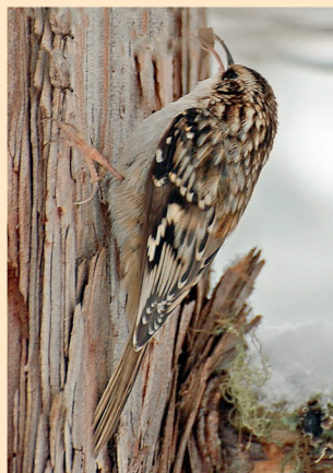
Brown Creeper Certhia americana

Resembles flaking tree bark and spirals up tree trunks while foraging. These little, long-tailed songbirds probe bark crevices with their down-curved dainty bills. They often nest behind bark flakes.