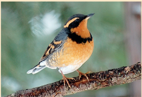
Varied Thrush Ixoreus naevius

A very small brown bird with a little tail and a giant spring song. Forages on the ground and in shrubs by Clay Creek. Builds a domed nest in tree cavities or root wads made of moss, lichen, twigs, roots, and grass.