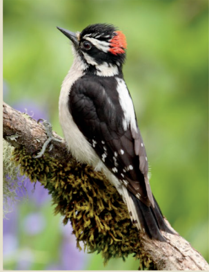
Downy Woodpecker Picoides pubescens

Small, acrobatic, black and white woodpecker with a stubby bill. Males have red crown patches. Often forages on smaller branches of broadleaf trees. Can be seen with mixed flocks of chickadees and nuthatches.