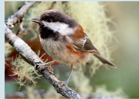
Chestnut-backed Chickadee , Poecile rufescens

The high frequency twitter above you in the canopy is most likely this pretty little songbird.