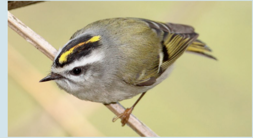
Golden-crowned Kinglet , Regulus satrapa

The high frequency twitter above you in the canopy is most likely this pretty little songbird.