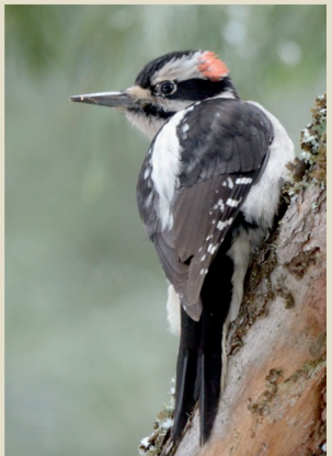
Hairy Woodpecker Picoides villosus

Small, acrobatic, black and white woodpecker with a stubby bill. Males have red crown patches. Often forages on smaller branches of broadleaf trees. Can be seen with mixed flocks of chickadees and nuthatches.