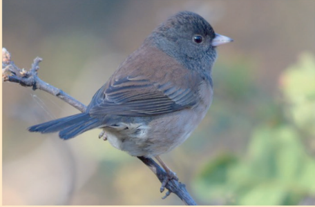
Dark-eyed Junco Junco hyemalis

The “clicking” sparrow with white outer tail feathers and a dark hood forages for seeds around shrubs and trees.