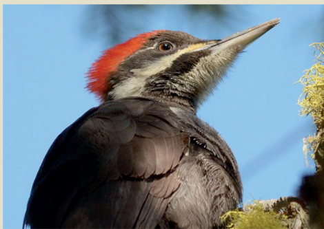
Pileated Woodpecker , Dryocopus pileatus

Similar to the Downy, but with a larger chisel-like bill and unspotted tail feathers. The long tail feathers are used to lean against tree trunks. Often forages on big conifer branches and trunks.