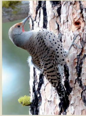
Northern Flicker Colaptes auratus

Architect of the large rectangular holes in stumps and tree trunks. A sighting of this reclusive, red-crested woodpecker is always special. Grows up to 19 inches tall.