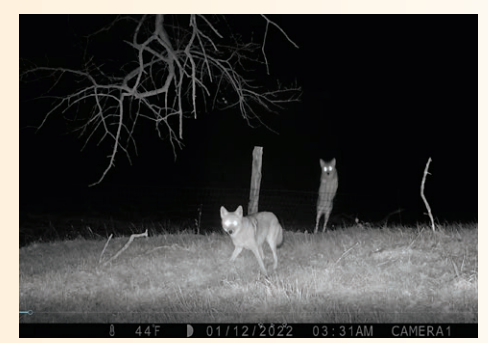
Top: Blacktail Buck at night on the bluff. (DSLR camera trap). Middle: Western Bluebird in fog. Bottom: Two coyotes hopping the fence. (trail camera)