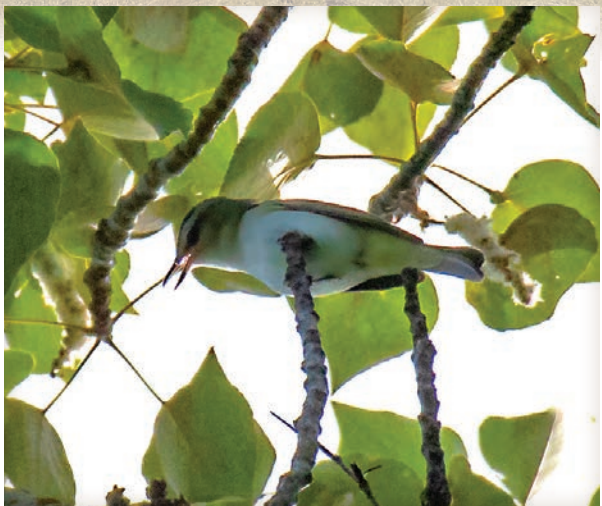
Red-eyed Vireo

the forest also supports a breeding Bald Eagle and Red-tailed Hawk pair, likely nesting Great Horned Owls, and Barn Owls, AND two baby Turkey Vultures discovered in a tree cavity! Big trees and big dead trees provide a haven for wildlife.