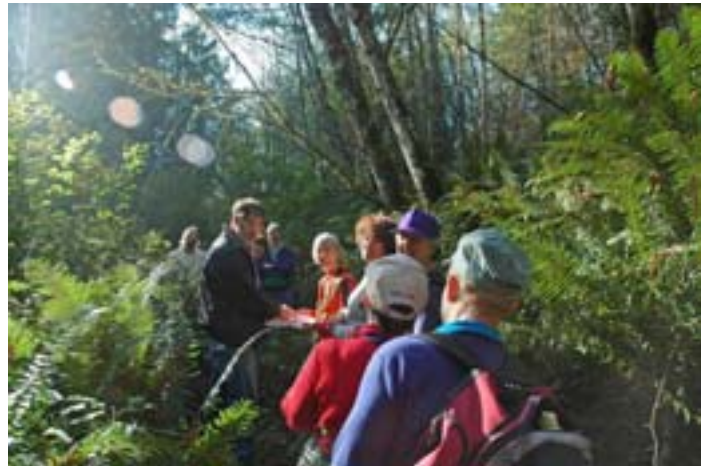
Coast Chapter members join on a monitoring visit near Coquille