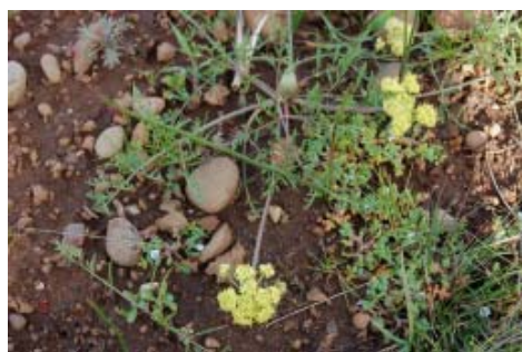
Cook's desert parsley

and Greg Bennett's property complements the reserve system by protecting a key part of