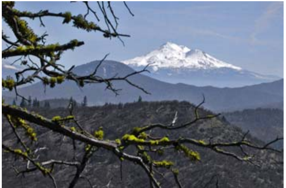
View of Mt. Shasta from protected property in Colestin