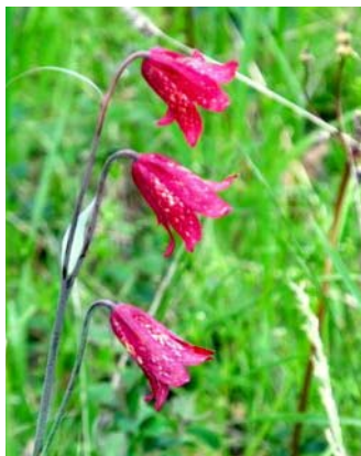
An endangered lily

nana. It grows tucked along the edges of buckbrush in chaparral, a threatened habitat in Southwest Oregon. The State of Oregon is considering listing White Fairypoppy as a threatened